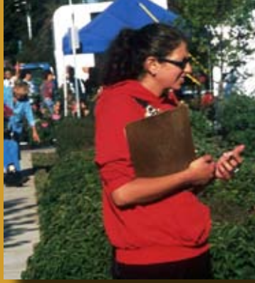
Entering shoppers are counted for 10 or 20 minutes.

Also, the 20-minute and 10-minute periods are more easily staffed than when a count is taken throughout the market's duration.