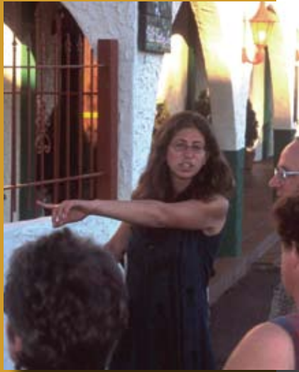
Touring the market site the night before an RMA

stand-alone exercises undertaken by individual markets, a CCO is a part of a complete RMA.